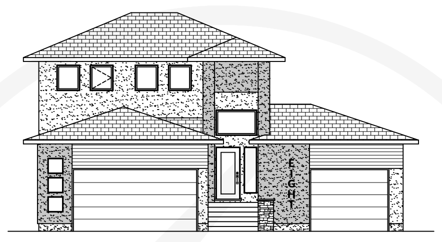
ARTIST'S REPRESENTATION - EXTERIOR MAY VARY